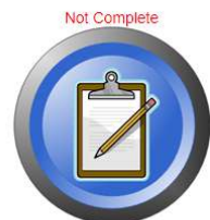
Enter Your Provider Information