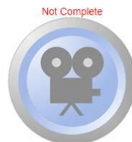
Watch the Orientation Video