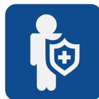
Health, Medical & Evidence Based